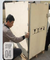
Fixed wooden case