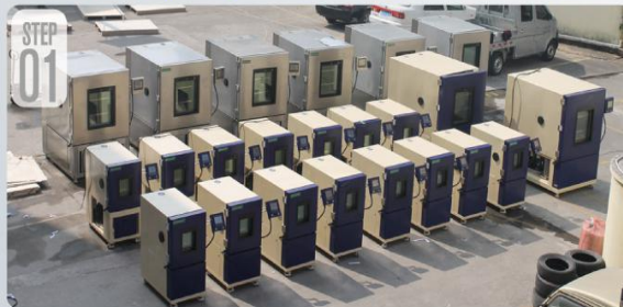
Environmental chamber have passed all the inspection and ready for packing