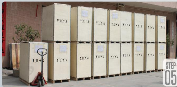
We packed it with fumigation and wooden case to protect the goods from any damage