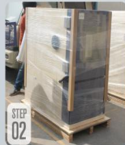
Paper angle bead